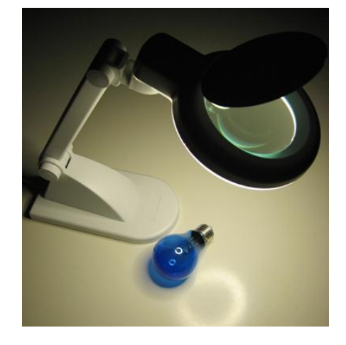
Fig.3 Light round the lens