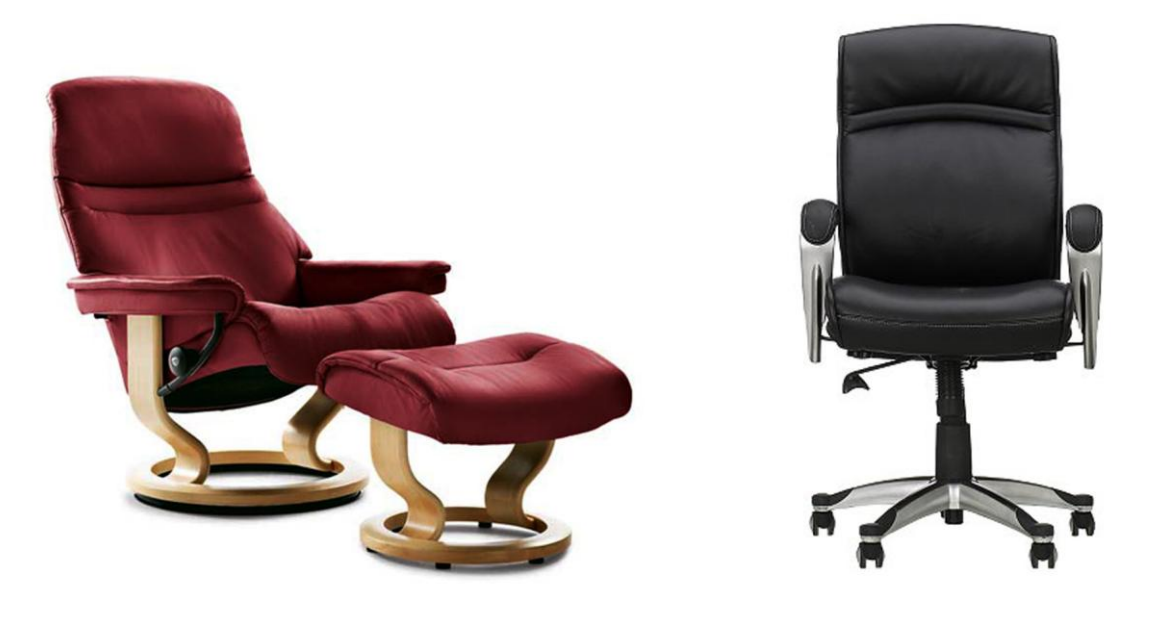
Fig.1These chairs provides all the features listed above allowing me to work in comfort for long periods of time both in the lounge and working at the computer.

Make sure you have all your materials and equipment near at hand so you don't have to stretch out for them.