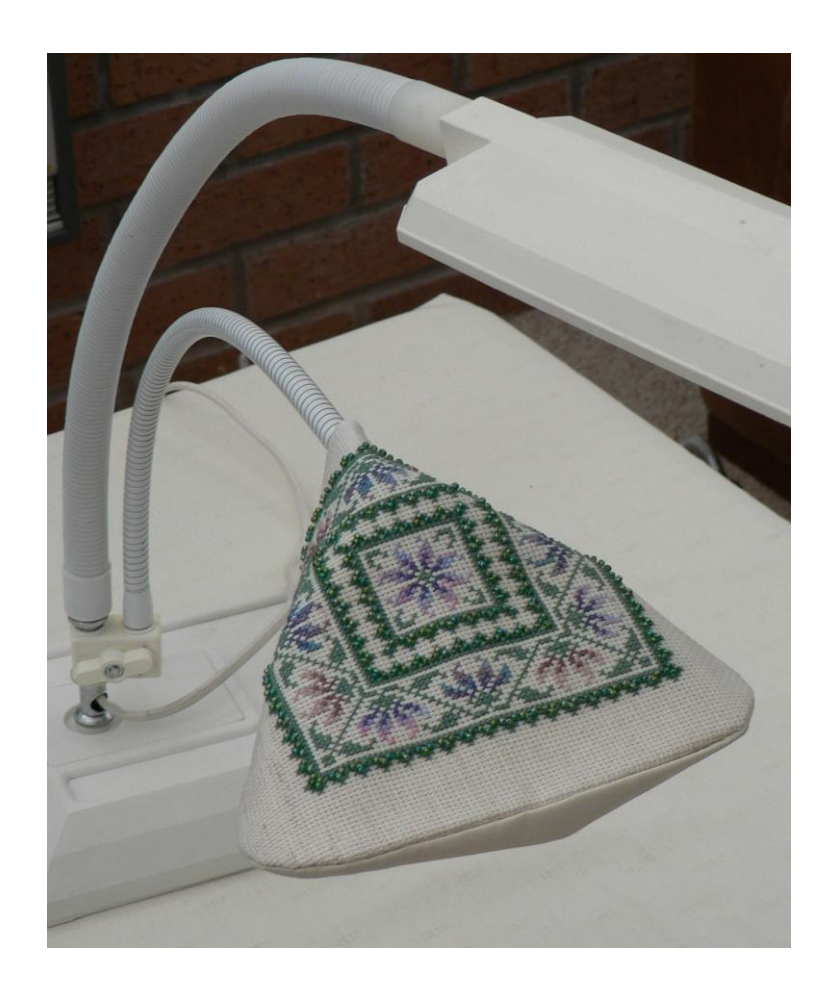
Fig.9 Embroidered lens cover

There are also magnifiers which hang round the neck, or can be attached to your glasses or fit on your head, but personally I find these difficult to work with and my choice would always be a desktop magnifying lamp, a floor light or an ordinary desk lamp fitted with a daylight simulation bulb.